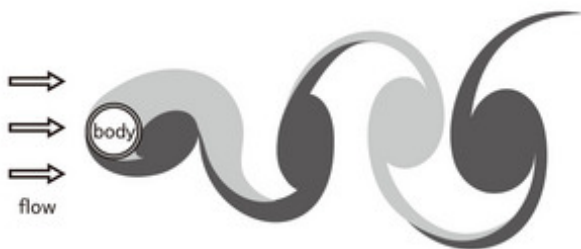
Fig. 1 Karman Vortex (Reference: Wikipedia "Karman Vortex")